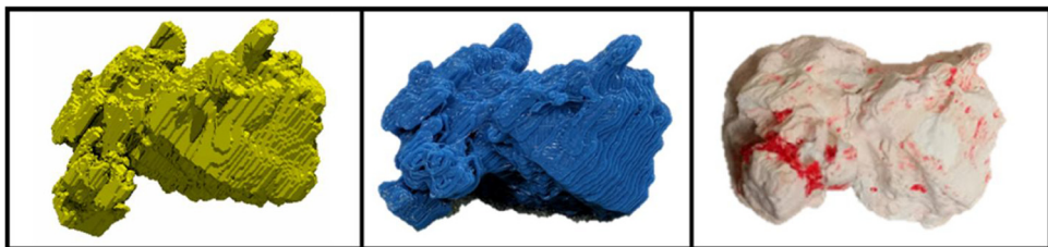
Fig. 1. Surface visualization (left), resultant 3D-print (middle) and vug cast (right).

The extremities are not captured well in the reconstruction, but this can be attributed to the limited resolution of the 3D-printed vug space.